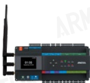
AHDU Series Controller