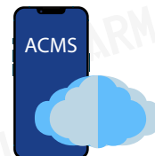
ACMS (Mobile credential cloud platform)