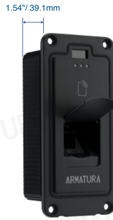
EP30CF (Without metal Case)