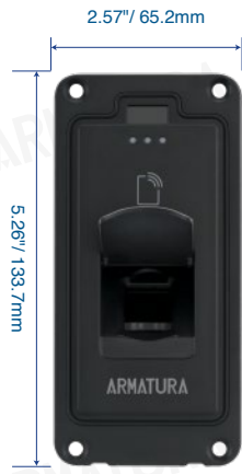
EP30CF (Without metal Case)