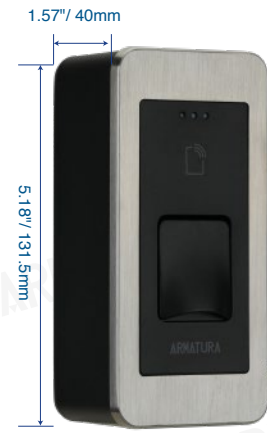
EP30CF (With metal Case & Back Case)