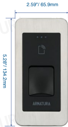
EP30CF (With metal Case)