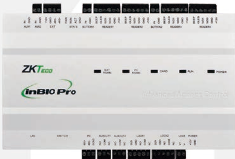
InBio-460 Pro Package B