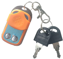
Remote control and keys