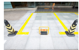
Private parking management