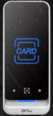
QR600 - V