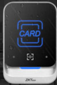
QR600 - H