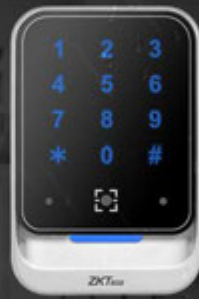
QR600 - HK