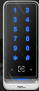
QR600 - VK