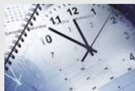
Time & Attendance