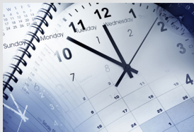
Time & Attendance