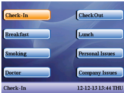
Function keys definition